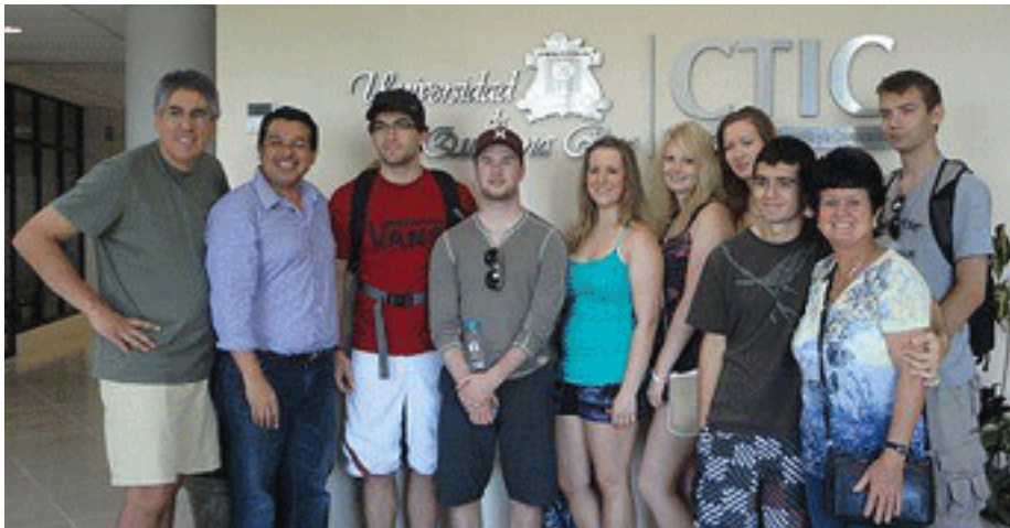
The group at the Universidad de Quintana Roo in Mexico.