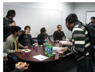
TA Pizza Party

The Centre offers a professional development program for TA's including an orientation, a manual, a website and many workshops throughout the term including WebCT workshops for TA's .