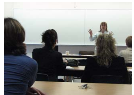
Research Week Presentation, 2008