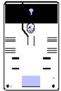
Back View— mounting bracket is shown in the Desk Mount Configuration